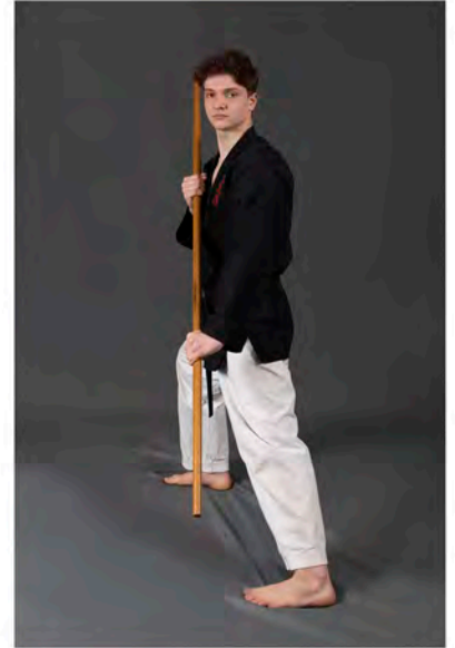
Reverse Low Block